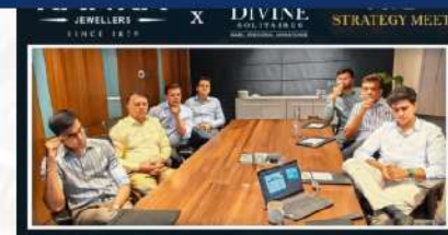
NATIONAL NEWS / 4 hours ago

Alia Bhatt Stuns At Cannes Film Festival 2026, Elevating Contemporary Elegance With Aesthetic Creations From Malabar Gold & Diamonds