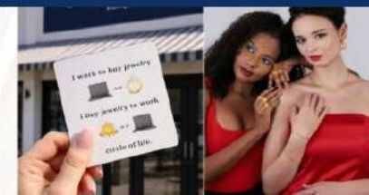
NATIONAL NEWS / 3 hours ago

Divine Solitaires And Ranka Jewellers Chart Aggressive Growth Strategy To Lead Pune's Solitaire Diamond Jewellery Market