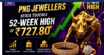
NATIONAL NEWS / 7 days ago

PNG Jewellers stock touches 52-week high of Rs 727.80 amid strong market momentum, strong festive demand