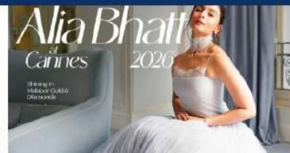
GLAMBUZZ / 2 hours ago

PNG Jewellers stock touches 52-week high of Rs 727.80 amid strong market momentum, strong festive demand